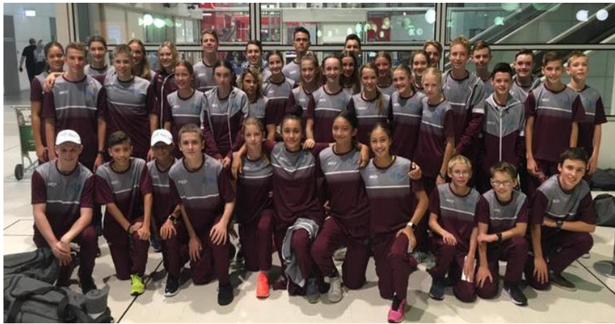
2019 Qld Little Athletics Team