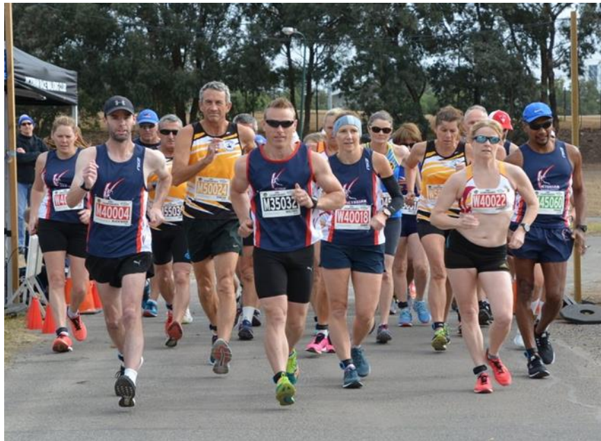
Start of the 10km road walk at Albert Park