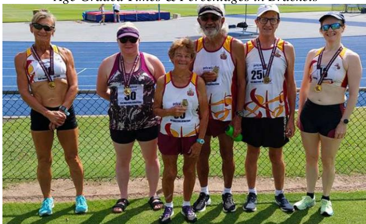
Happy race walkers after the recent 3,000 metre QMA Championships