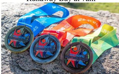
The medals for the Games have now been unveiled

The walks will take place on Sunday November 14 th at the Luke Harrop Cycling Circuit at Runaway Bay at 7am